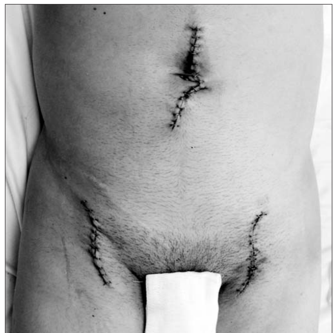
Figure 3. Postoperative image

The reduced size of the abdominal incision (Fig. 3) decreases healing time and minimizes the risk of wound infections. The median hospital stay was 7.7 days, which is similar to that from U. Alpagut's study from 2003 (1), but a little higher than that of U. Acikel from 1998 (23) (4.7 days) and T. Klokocovnik from 2001 (24) (6 days). Postoperative pain intensity is low and responds well to non-opioid analgesics. Reduced mobilization of intestinal folds and extraperitoneal retraction contribute to faster restoration of bowel movement, with minimal ileus. 72% of our patients return to normal feeding 24 hours postoperatively, which is similar to previously cited studies (1,23,24). Infrarenal abdominal aortic exposure is highly adequate and it provides excellent condition when performing the anastomosis within 150 minutes total operating time and 15 minutes of aortic clamping, similar to literature data (1,2,23,25,26). Due to the decreased length of