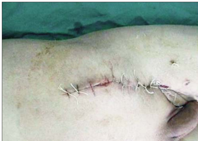
Figure 1. Chronic wound suppuration in the Scarpa triangle

The procedure was performed under general anesthesia with the patient in dorsal decubitus. Due to the previous laparotomy, we started with an open laparoscopy in the right iliac fossa using a 2 cm incision similar with the McBurney incision used for classic appendectomy. Other two trocars were placed in a paraumbilical and suprapubic position. After adhesiolysis, we inspected the omentum and created a flap based on the left epiploic vessels. With a minimum dissection, the flap reached the left inguinal ligament and