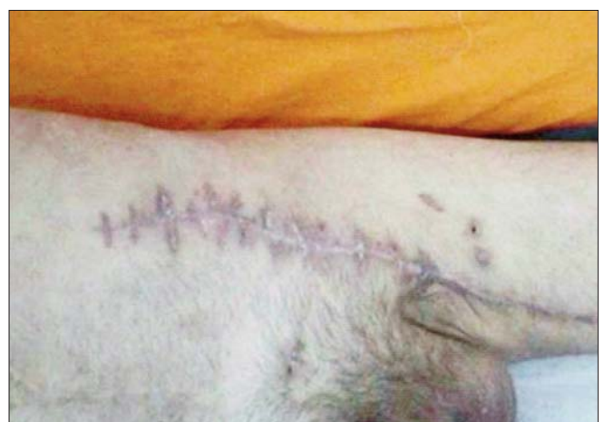
Figure 3. Aspect of the wound at 2 months after surgery.

Our patient had a favourable anatomy which allowed a very easy mobilization without the need of a delicate dissection or special instruments. Compared to a classic laparotomy approach, the advantages were obvious in terms of early recovery.