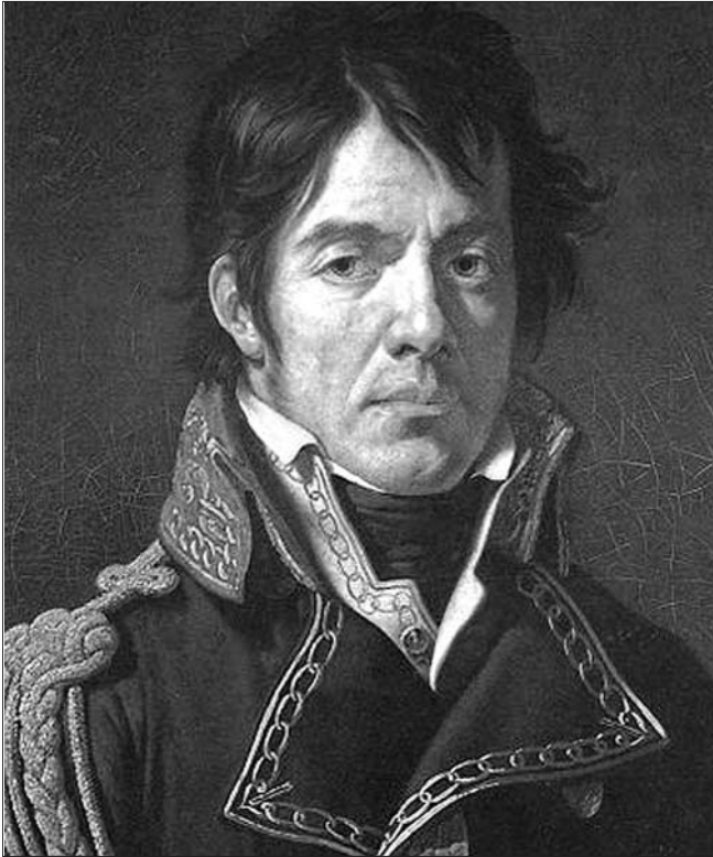
Figure 1. Baron Dominique-Jean Larrey

surgeon in France's revolutionary and Napoleonic armies which accompanied all over Europe, in Syria, Egypt, Russia, in a total of 25 campaigns and 60 battles. He became Chief Surgeon to the Imperial Guard, Surgeon in Chief to the Imperial Army and Professor of Surgery at the army medical school at Val-de-Grâce hospital in Paris (2).