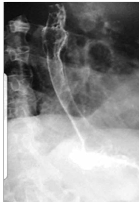
Figure 2. Contrast study showing fully covered esophageal stent used for sealing an eso-gastric anastomotic leak

proximal end of the stent can be placed at least 2 cm distal from the upper esophageal sphincter.